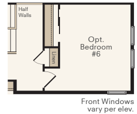
Opt. Bedroom #6 ILO Loft